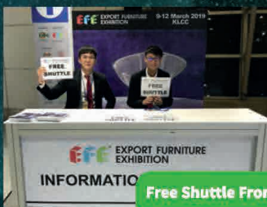
Free Shuttle From Airport To Hotel