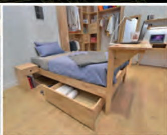
DEEP FURNITURE SDN BHD