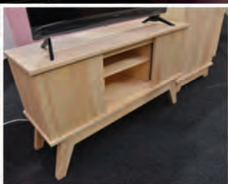
AH HAI INDUSTRIES SDN BHD