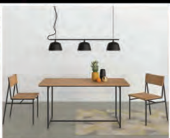
MERANTI FURNITURE SDN BHD