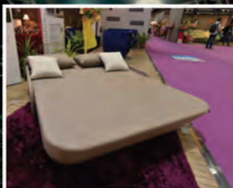
DYNAMIC FURNITURE INDUSTRIES (M) SDN BHD