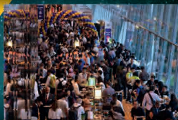
Buyers' Networking Night