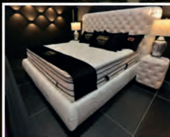
GOODNITE SDN BHD