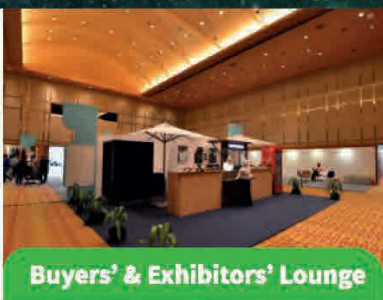
Buyers' & Exhibitors' Lounge