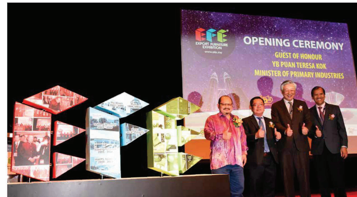
Datuk Seri Shamsul Iskandar officiating the opening of EFE 2019.