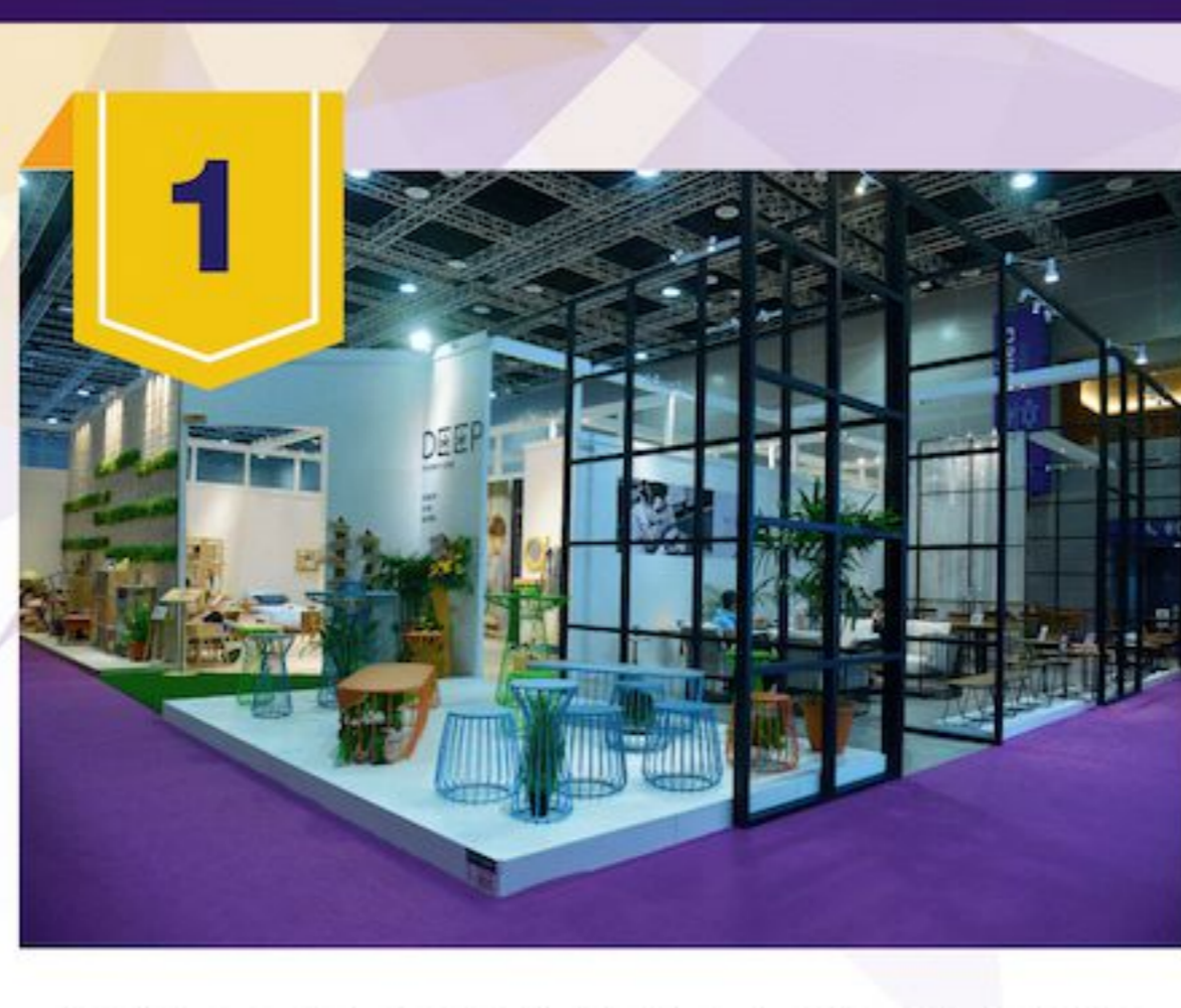
DEEP FURNITURE SDN BHD