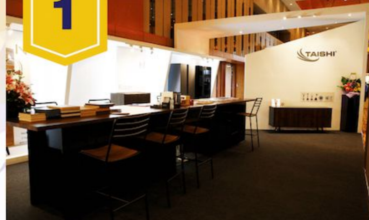
TAISHI-TECH MARKETING SDN BHD