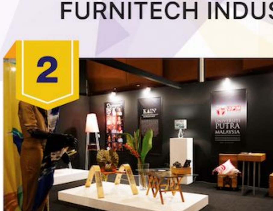
UNIVERSITI PUTRA MALAYSIA