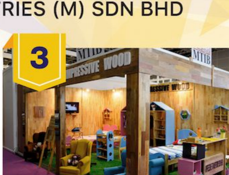
IMPRESSIVE TRANSFORM SDN BHD