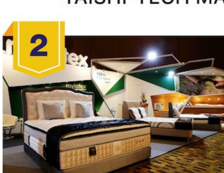
AEROFOAM MANUFACTURING SDN BHD