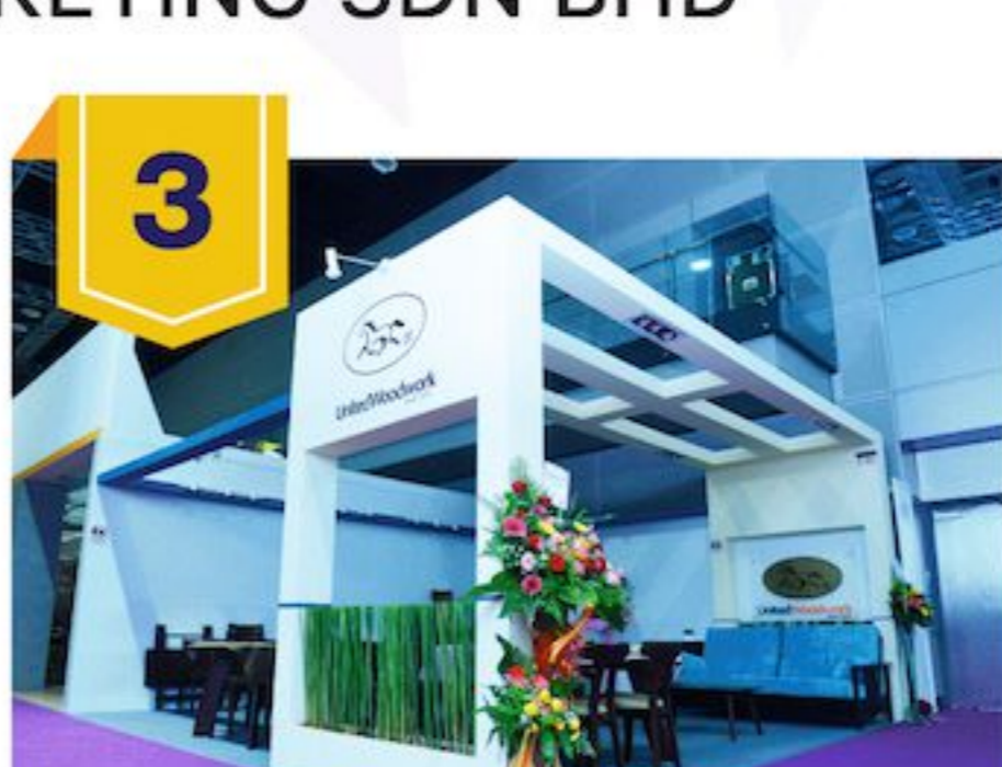
UNITED WOORWORK & CONSTRUCTION (M) SDN BHD