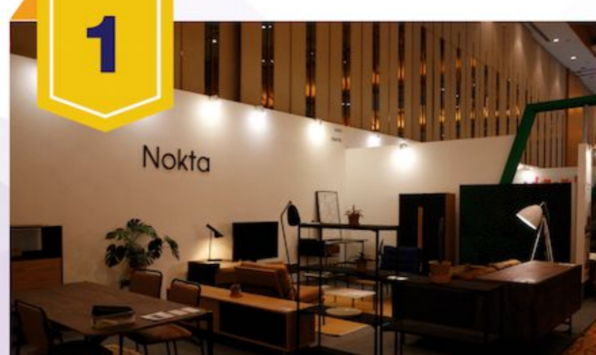
FURNITECH INDUSTRIES (M) SDN BHD